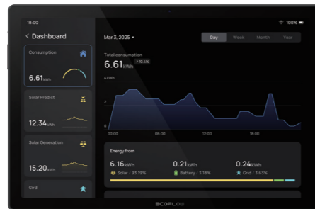
Home Energy Consumption