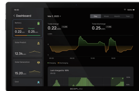
Battery Charge and Discharge